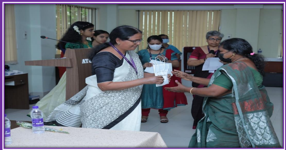
Under this project, Bank provided "KELTRON" 10 Channel programmable digital hearing aid" to beneficiaries selected with the support of Thiruvananthapuram District Health Department Authorities. Smt. Veena George, Hon. Minister for Health and Woman & Child Development Govt. of Kerala inaugurated the function