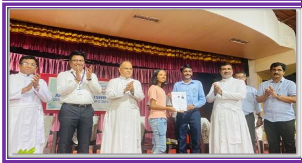
As part of Promoting Education, Bank provided Scholarships to 64 students . Bank implemented this project directly in co ordination with Devamatha School, Kuriakose Elias Service Society , Thrissur