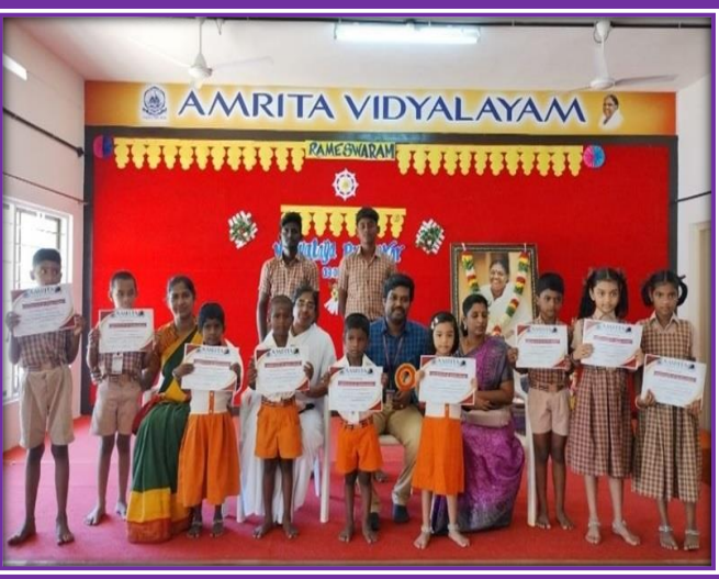
Under this project, Bank supported 19 students from different categories with Scholarships . Further Bank provided educational materials to the students of Amritha School, from economically weaker section.