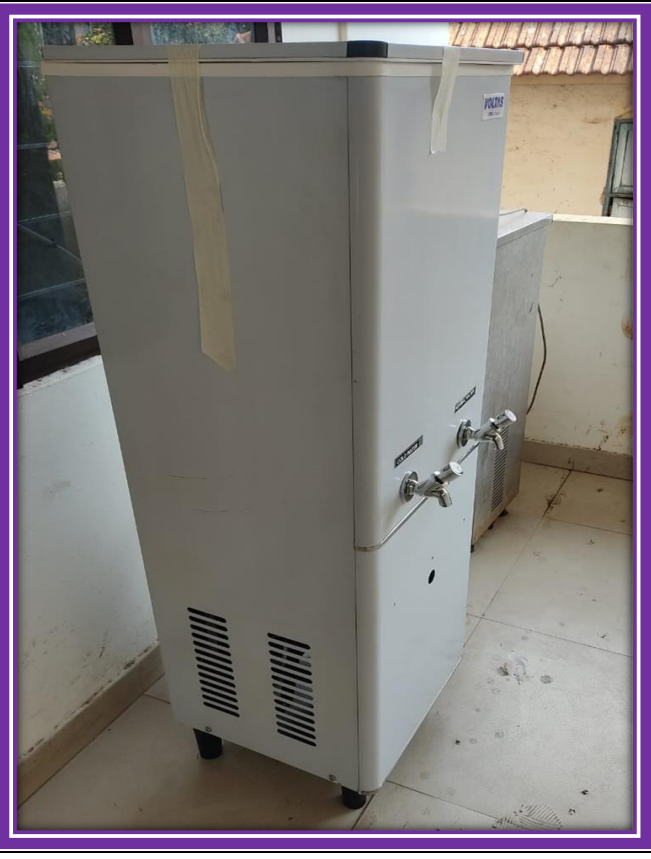
In this project, Bank provided Water Cooler to Govt Model Higher Secondary School for Boys, Thrissur for Safe Drinking water to students, teachers and other staff members