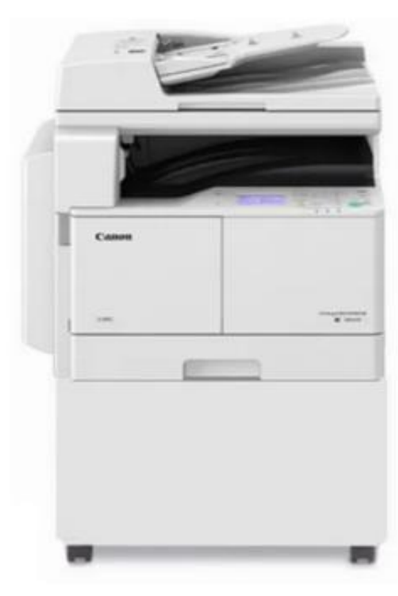
Under this Project, Bank provided office upgradation facilities to CDS Poomangalam Panchayath for livelihood enhancement of their members