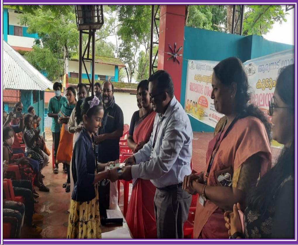
In this project Bank Distributed of study materials to students in association with CDS Kudumbasree of Aryanad Grama Panchayath