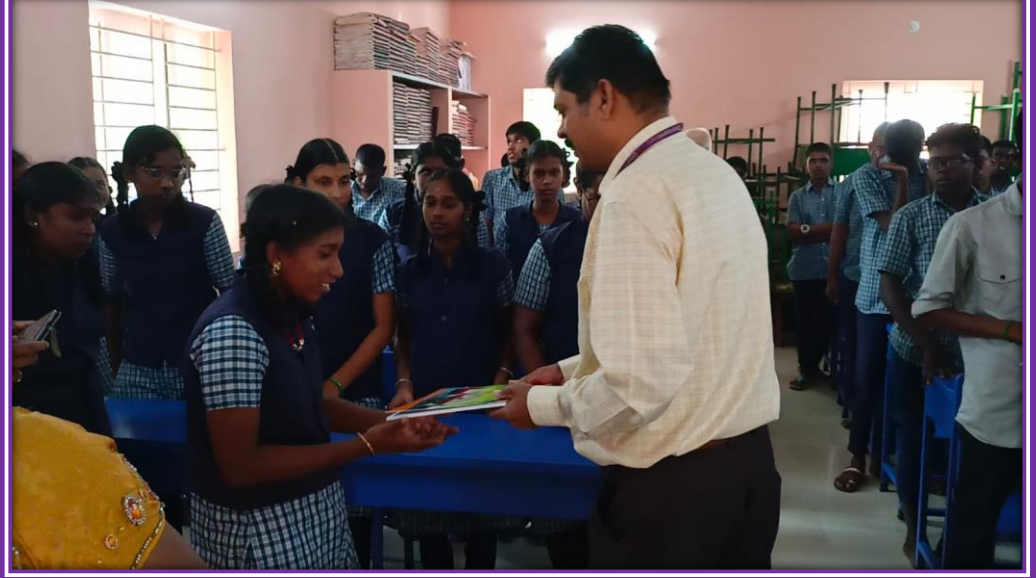
Supply of Educational Materials, and Water Purifier to Govt Blind School Thanjavur. Distribution of Books and Meritorious Award for School Children at Govt School Thanjavur